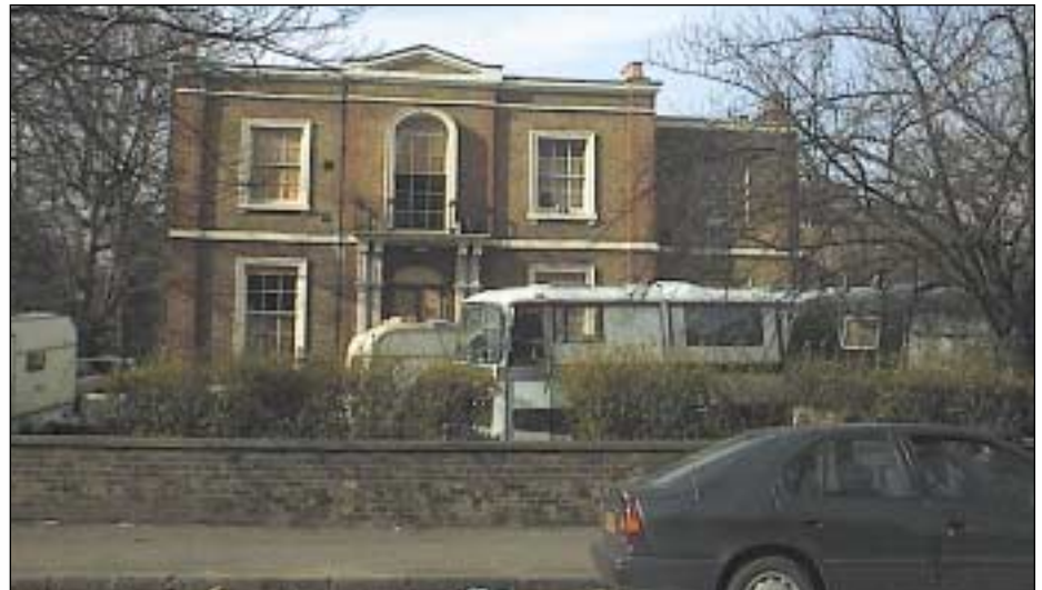
Photographs taken 2001